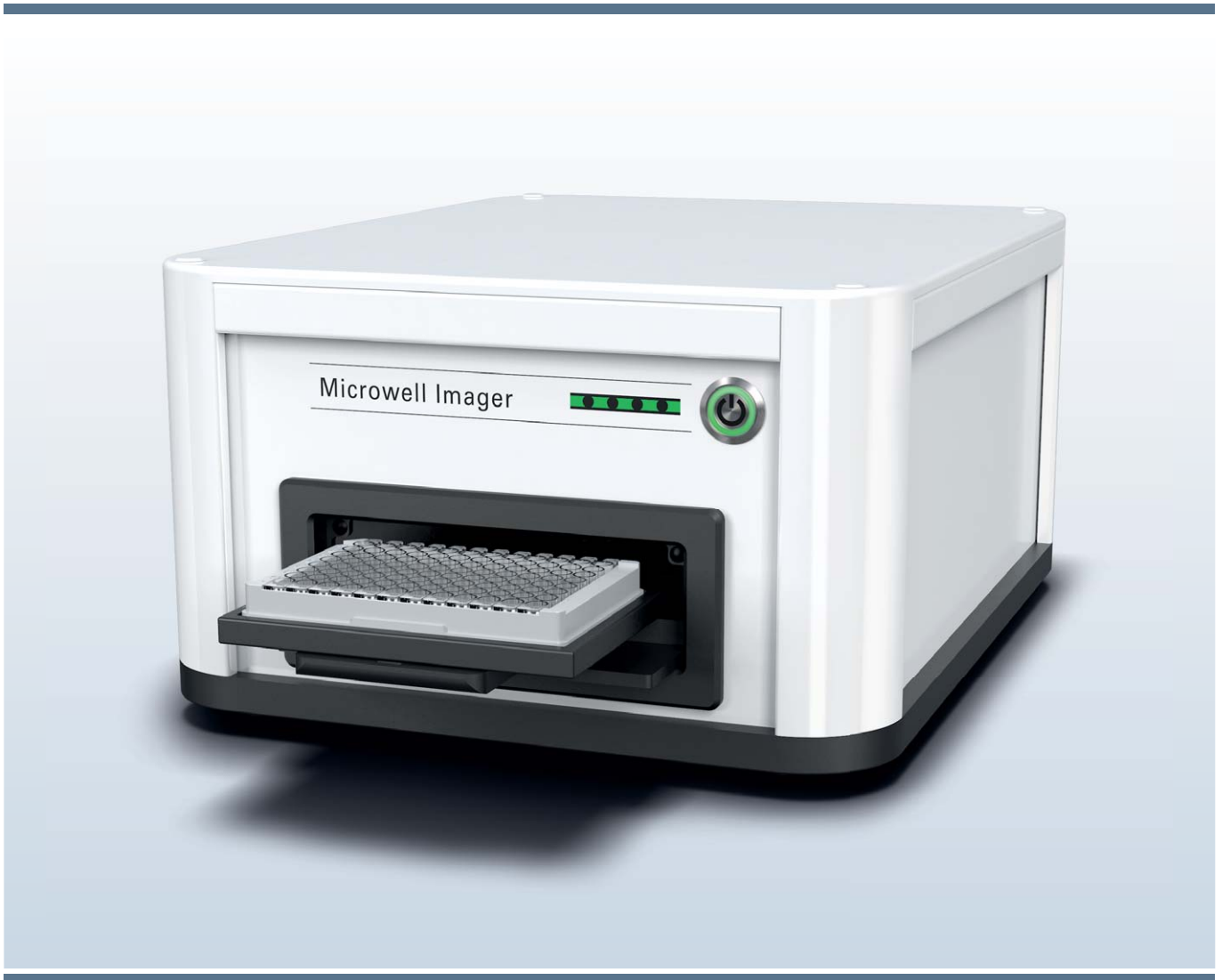
Image acquisition and evaluation of EUROMicroblots